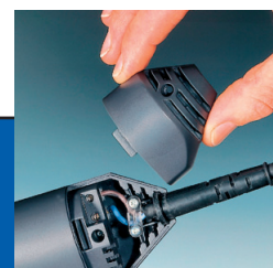
Field Changeable Cord