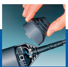
Field Changeable Cord